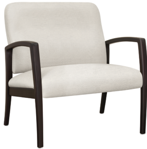
Model: VLG112J0 34W 26D 36H 30SW 19SD 19SH 26AH

Generously sized and built for maximum stability and strength with a solid steel inner frame, the Valentia Bariatric accommodates generous proportions. Designed to reflect morphology and ergonomics specific to bariatric needs, this model can be connected to Guest chairs and Center Linking Tables as part of lounge/waiting area seating.